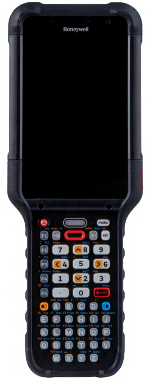
Fig 1: CK67 Ultra-rugged 5G mobile computer on the Mobility Edge™ platform

The CK67 is designed to endure the most challenging environments in warehouses and DCs. Warehouses are as busy as ever and operators need to keep their workflows running efficiently with maximum uptime. Users in warehouses can rely on the CK67, withstanding up to 8ft drops across operating temperatures and 4,000 1.0m tumbles. Users can be confident with the intense durability testing the CK67 undergoes before release, that it will solidify and keep operations and is the ultimate long-term investment.